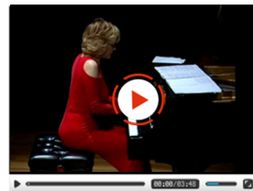
OBLIVION composer Astor Piazzolla